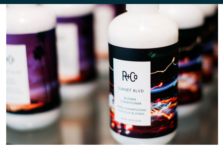
Consultations are available to help customers find the right hair products for their needs.