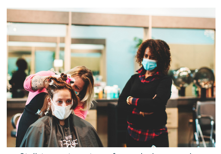
Stylists create a stress-free, relaxing experience for clients at Abyssinia Hair & Beauty Clinic.